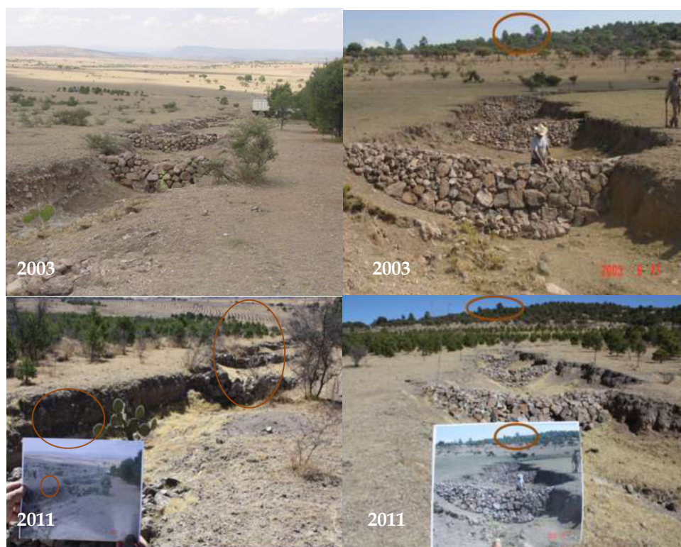
Fig. 2. Successful cases of ecosystem restoration. Ejido 16 de septiembre, Durango, Mexico.

The National Forestry Commission of Mexico (CONAFOR, as called in Spanish) through the ProArbol program provides incentives to forest owners who wish to perform actions for the protection, conservation, restoration and sustainable use of forest resources in Mexican ecosystems. CONAFOR has applied financial support for conservation and restoration in almost 494,000 ha from 2001-2007. Since 2005, CONAFOR has been the main partner of United Nations Convention to Combat Desertification in Mexico. One of the major projects implemented to combat desertification include the reforestation of degraded areas for soil conservation (Figure 2).